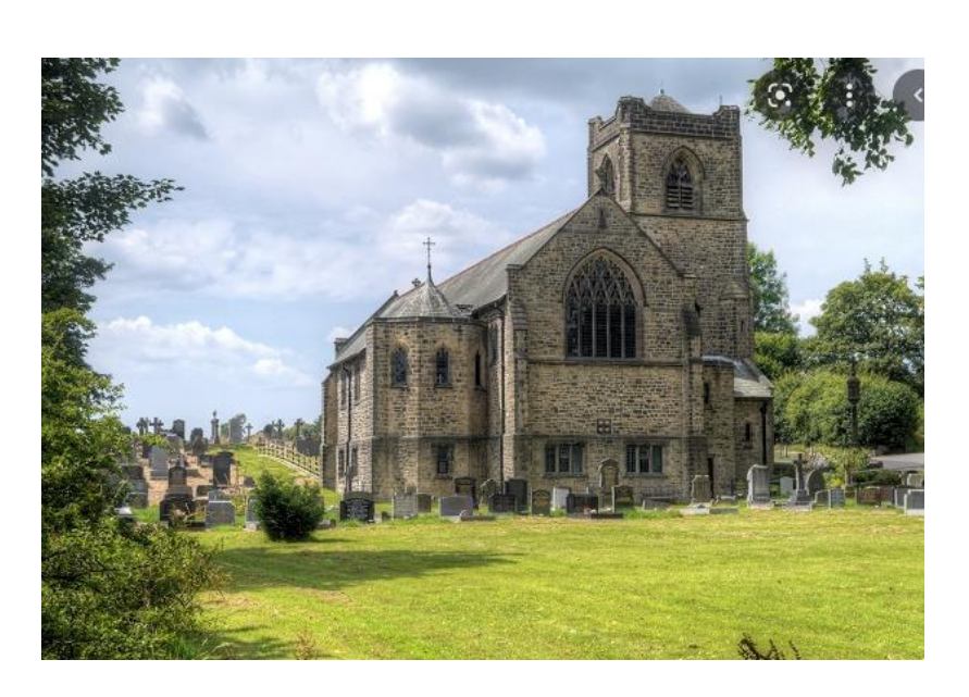
All Age Church Service is on Sunday 10<sup>th</sup> March.