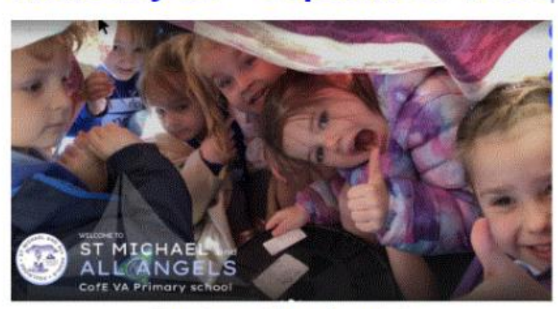
Do you have a child age 4 or under? Are you starting to consider your options for their primary education? Don't know where to start?

Please come and see what St. Michael And All Angels have to offer.